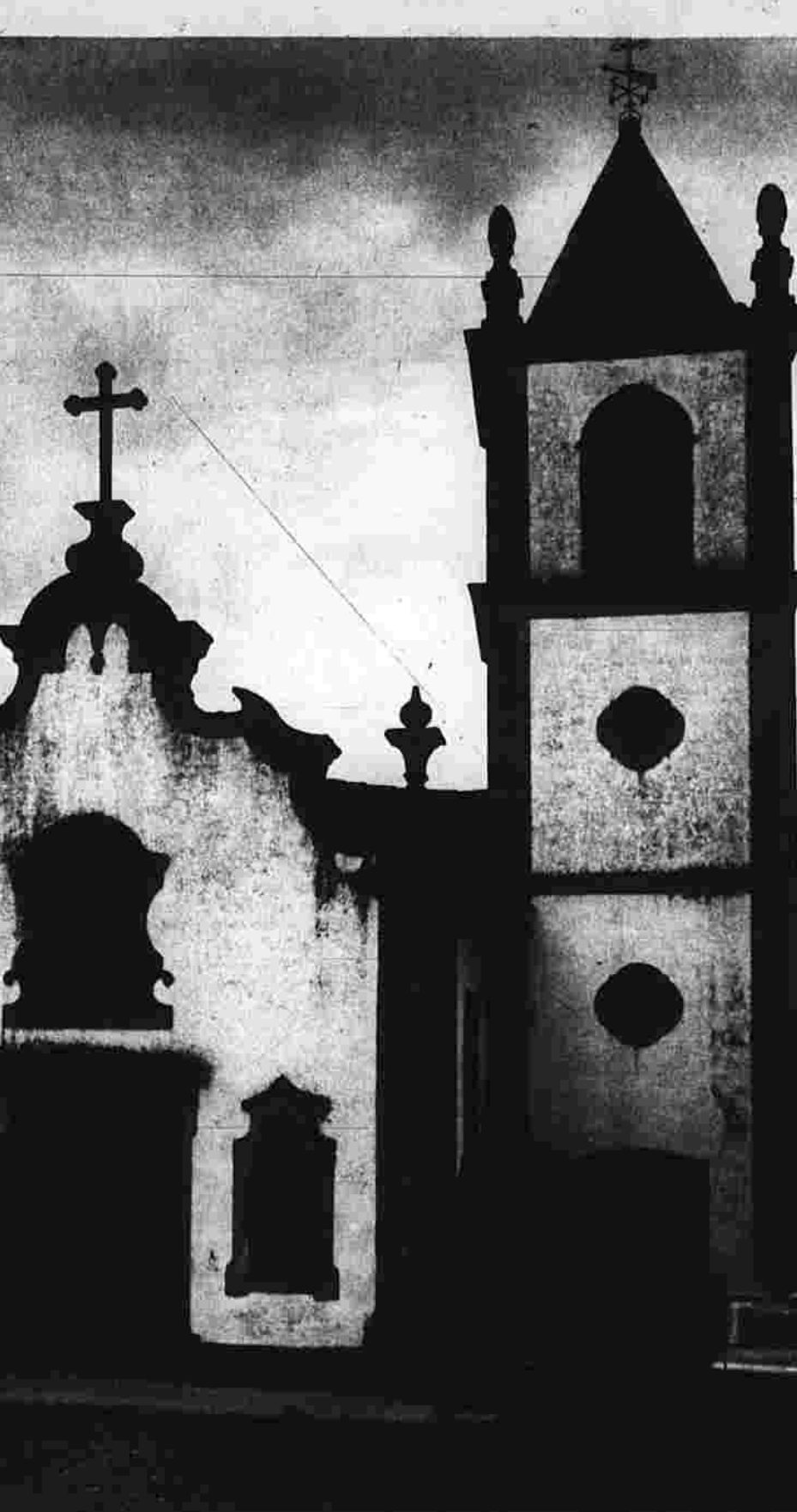
FISHERMEN'S CHAPEL, NAZARE, PORTUGAL

Some scientists see no reason why later colonies could not be established on the other planet surfaces and on the satellites of the major planets which are enveloped in a dense, deep gaseous atmosphere.