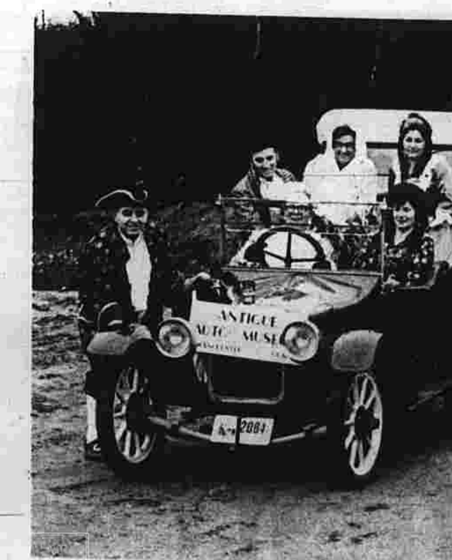
They Made It on Time. Will You?