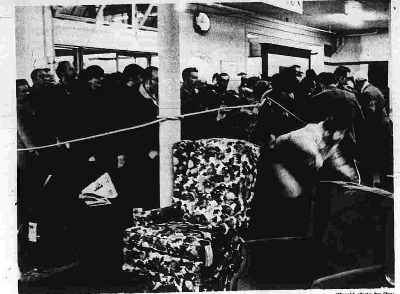
The Charge of the Sales Brigade

Early bargain hunters at Watkins Bros. are like blurred streaks at a track meet as the restraining ropes come down this morning on the day of 9 to begin two days of Washington's Birthday Sale bar-