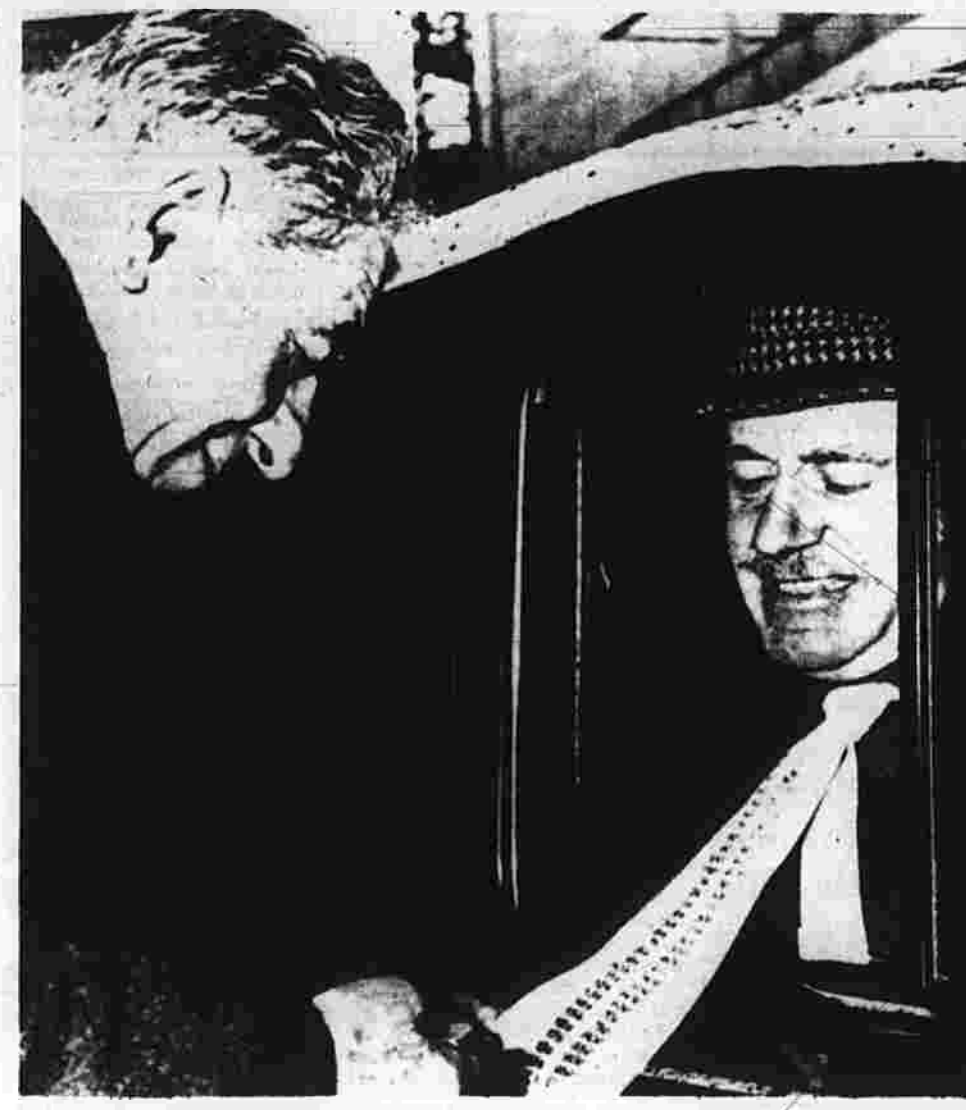
A London taxi driver wears large yellow necktie displaying the new and old currency as Britain switched to a streamlined decimal coinage.

By H.L. SCHWARTZ III Associated Press Writer WASHINGTON (AP)—Secretary of Commerce Maurice H. Stans had an interest of more than $200,000 in a Penn Central subsidiary at the time his department was involved in government efforts to keep the failing railroad afloat.